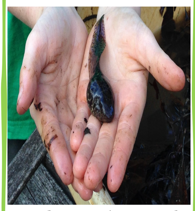
Hands-on Environmental Education