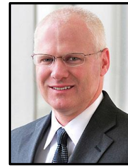
Russell McMurry Commissioner of the Department of Transportation