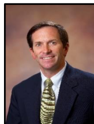
Braye Boardman Lt. Governor Appointee (Current term expires on 06/30/2021)