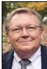
Carl Riggs Speaker of the House Appointee (Current term expires on 06/30/2023)