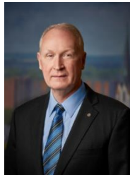
Truitt Evenson Speaker of the House Appointee (Current term expires on 07/20/2027)