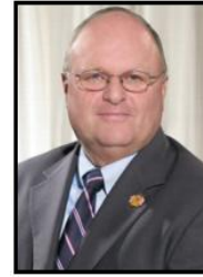
Eddie Canon Speaker of the House Appointee (Term expires on 06/30/2025)