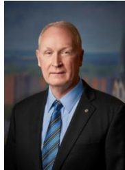
Truitt Eavenson Speaker of the House Appointee (Current term expires on 07/20/2027)