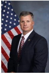
Walter Rabon, Chairman Commissioner of the Georgia Department of Natural Resources