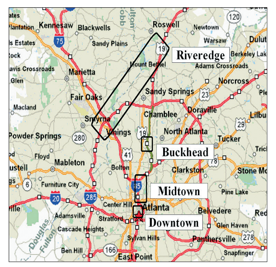
Figure 1. Study areas within the greater Atlanta metropolitan area with building locations monitored for bird strike mortalities, 2 August – 13 October 2005.