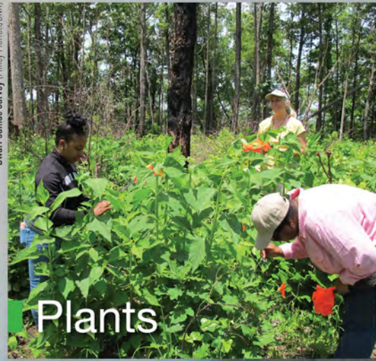
Dwarf sumac survey

Restoring native grasslands on DNR properties continued to attract rare birds, including a nesting population of Bachman's sparrows last summer at Joe Kurz Wildlife Management Area in Meriwether County.