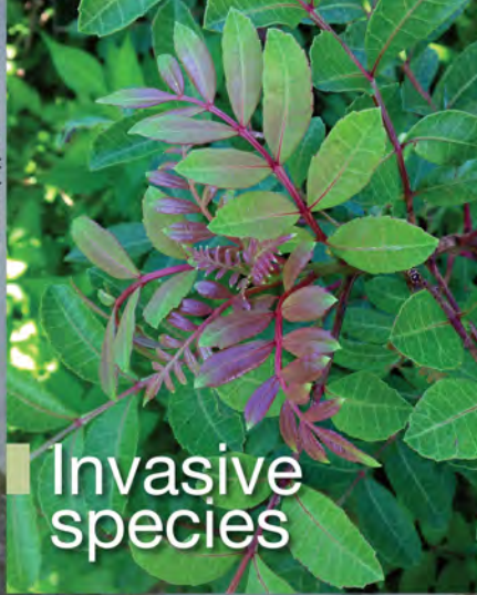
Brazilian pepper

A project with Young Harris College recorded large numbers of sicklefin redhorse migrating up Brasstown Creek into Georgia, plus the most upstream record in Brasstown for this fish, another candidate for federal listing.