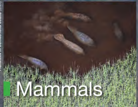
Manatees in Cumberland Sound