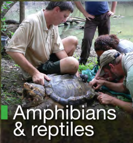
Alligator snapping turtle study (Brian Folt)