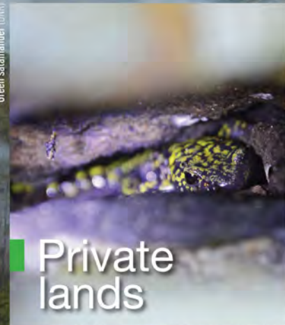
Green salamander

We discovered two unknown north Georgia populations of bog turtles , federally listed as threatened, through extensive review of possible sites and wide-spread trapping in tandem with Clemson University.