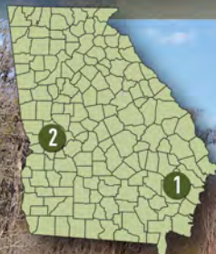
Morgan Lake (MVC)

off helped landowners learn and navigate conservation easements and federal programs such as the Natural Resources Conservation Service's Environmental Quality Incentives and Working Lands for Wildlife.