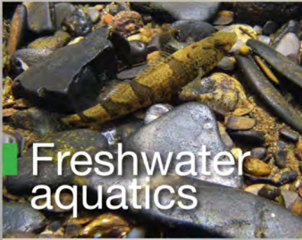
Snail darter (Conservation Fisheries)